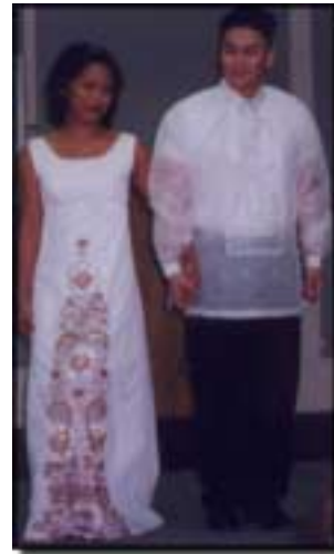
The Philippine Terno and Barong

The Filipino American Student Cultural Center with the assistance of the International Student and Scholar Services organized the "Taste of Asia" which was held on October 16, 1999. This was the first time that Asian student organizations were able to showcase their distinctive cultures. Faculty and staff from the College of Arts and Letters, College of Education,