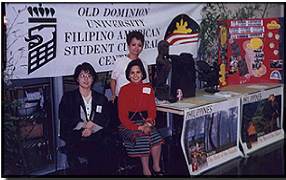
The FASCC Booth

The Filipino American Student Cultural Center with the assistance of the International Student and Scholar Services organized the "Taste of Asia" which was held on October 16, 1999. This was the first time that Asian student organizations were able to showcase their distinctive cultures. Faculty and staff from the College of Arts and Letters, College of Education,