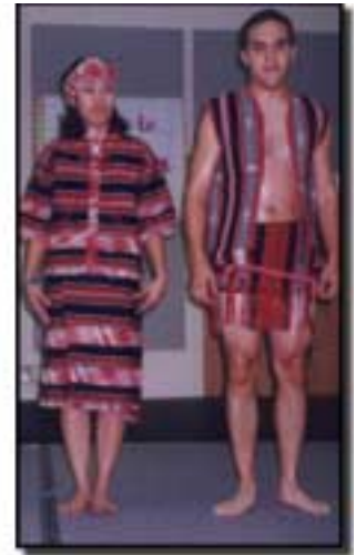
Costumes of the Igorots.