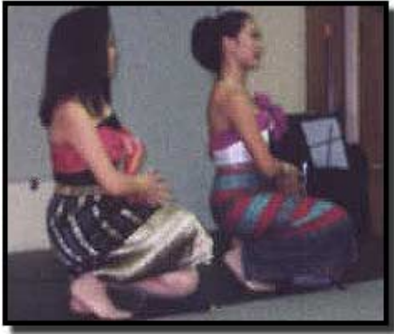
Thai dance number

OCCS, Institute of Asian Studies, Center for Regional and Global Study, and the Multicultural Student Services participated in the event. Over 300 people attended and enjoyed the affair. The event was highlighted with an Asian food festival, display booths, and a cultural programme from dances to martial arts. The following student organizations helped to make the event a success: Filipino American Student Association (FASA), Asian Pacific American Student Union (APASU), Vietnamese Student Association (VSA), Chinese Student & Scholar Association (CSSA), Korean American Student Association (KASA), Indian Student Association (ISA), Chinese Student Association (CSA), and Nichi-bei Student Association.